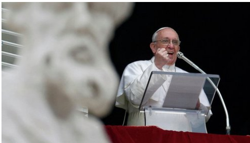
Pope Francis I

The good news that we now wish to share with you is that we are at last living during the reign of the 8 th "king" and that we are only few years away from the glorious Second Coming of Yahushua, and eternity. However, between now and the Second Coming, we have to pass through the mother of all persecutions and trials. There is much work to be done in our hearts and characters, and much work to be done warning the world of what is about to transpire. Are we ready for life under the reign of 8 th "king," the last pope of Rome? We pray that we all will become ready before our personal probation is forever closed.